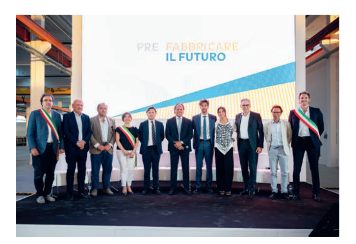
Final photo of inaugural event