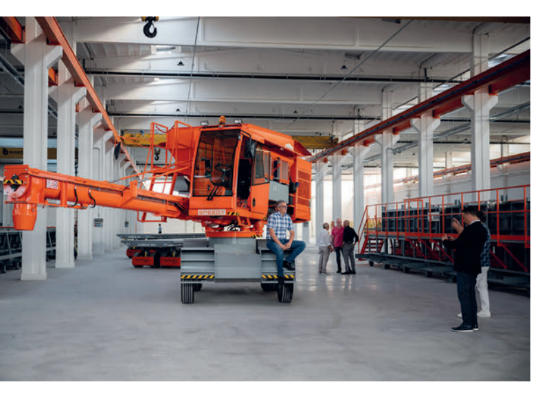
Speedy for concrete distribution