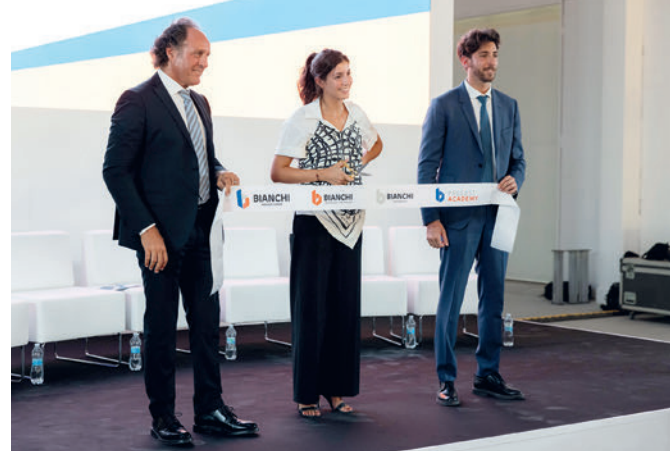
The Bianchi Prefabbricati ribbon-cutting ceremony