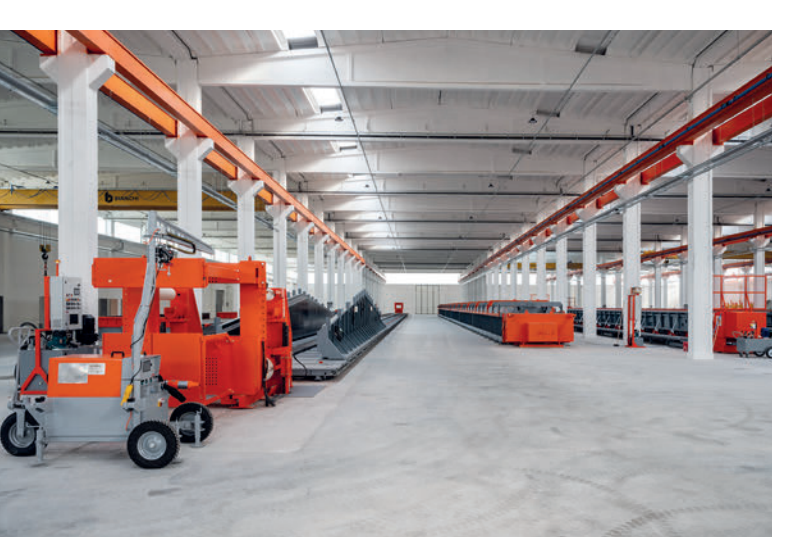
General view of formwork, beam track and wing formwork

Prefabbricati" production unit in the inaugural ceremony held on the 4<sup>th</sup> September. Built in a few months on a site of approximately 100,000 square meters located in Colorno (Parma), the new plant is positioned at the top of its sector thanks to state-of-the-art production equipment using the most innovative technologies, being fully "Industry 4.0" ready, oriented towards sustainability with a large photovoltaic sys-